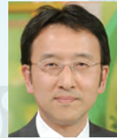
Dr. Takashi Ono Chairman of the 9th IOC